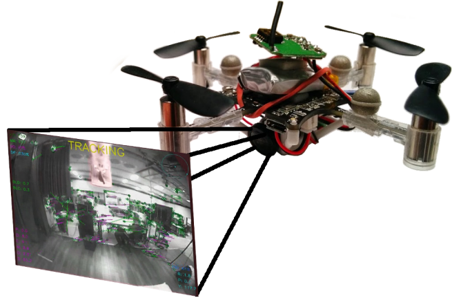
Fig. 1: Crazyflie nano-quadrotor with attached camera. 25 g total weight, 3.5 minutes of flight time and 9 cm across.

The research leading to these results was supported by the BMBF within the Software Campus (NanoVis) No. 01IS12057. We thank BitCraze AB for their on-going cooperation with us.