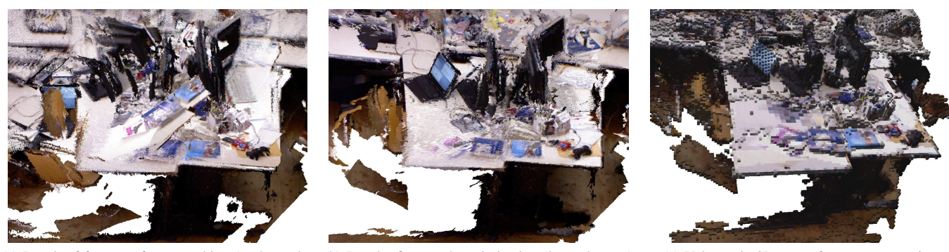
(a) Result of frame-to-frame tracking (no loop clo- (b) Result after graph optimization (loop closures) (c) Volumetric 3D map after post-processing sures)