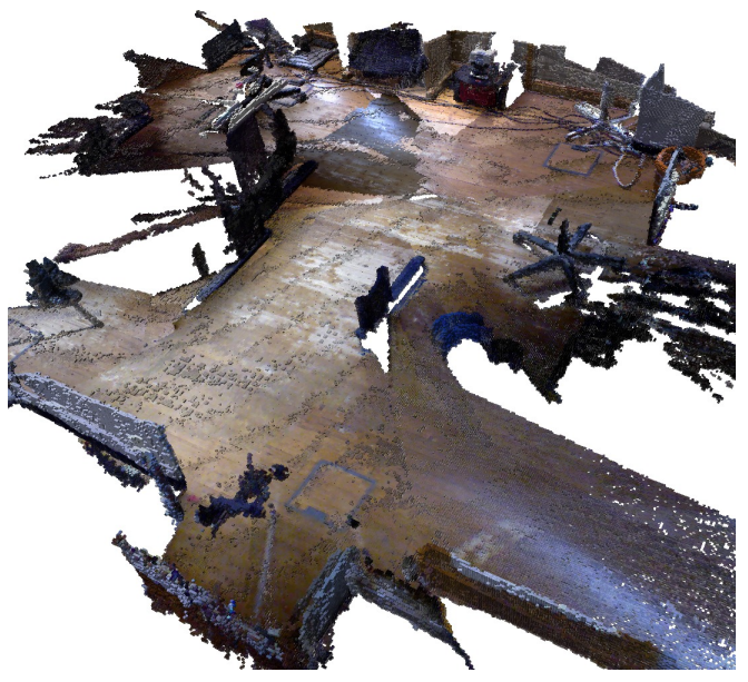
(c) Output: voxel grid (here displayed at 1 cm resolution)

Fig. 1. Our approach registers sequences of RGB-D images (a) to recover the trajectory of the camera (b) and to create globally consistent volumetric 3D models (c).