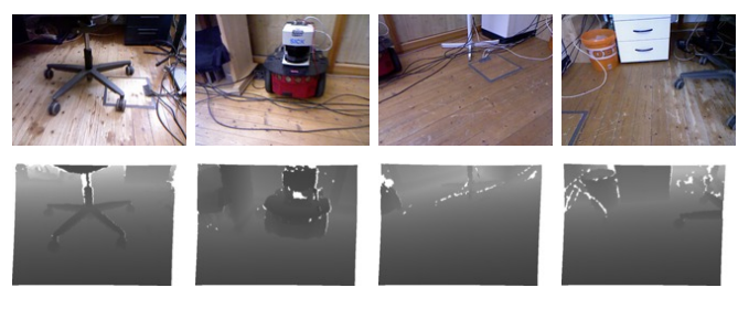
(a) Input data: Sequence of RGB-D images

In this paper we present an approach to SLAM based on RGB-D-data that consists of the four processing steps illustrated in Figure 2. First, we extract visual features from the incoming color images. Then we match these features against features from previous images. By evaluating the depth images at the locations of these feature points, we obtain a set of point-wise 3D correspondences between any two frames. Based on these correspondences, we estimate the relative transformation between the frames using RANSAC.