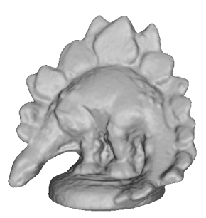
minimal ratio reconstruction