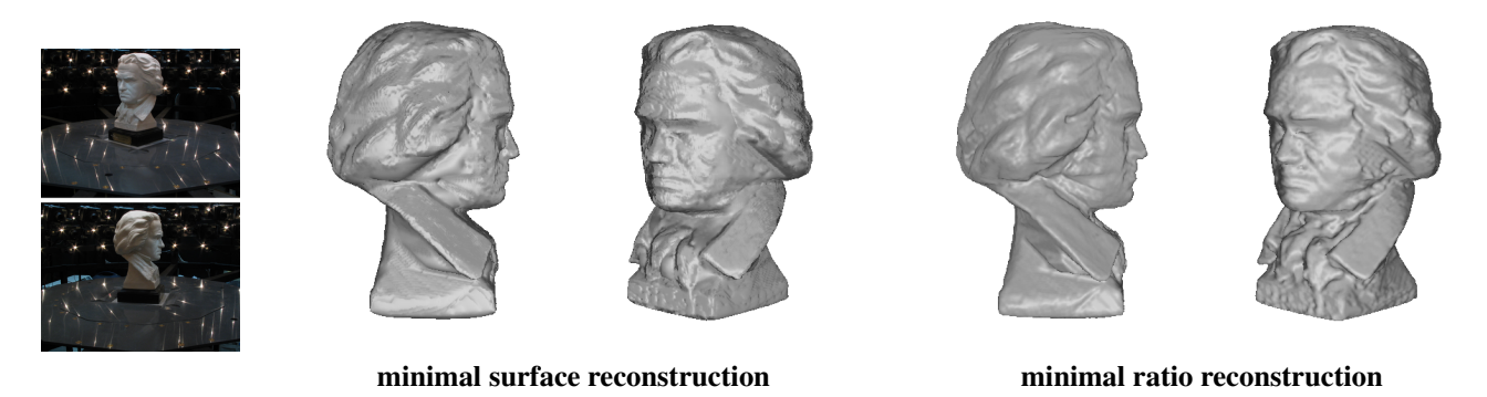
Figure 4. Beethoven sequence. 2 of 33 input images of resolution 1024 \times 768 and two views of the reconstructions with the silhouette-constrained minimal surface model, introduced in [13], and the proposed ratio optimization. Analogously, in contrast to the minimal ratio model, the minimal surface model tends to oversmooth concavities (e.g. at the cheeks or under the chin) due to the presence of shrinking bias.

achieves a higher grade of accuracy, especially at deep indentations (e.g. at the cheeks or under the chin).