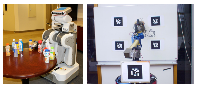
(a) tactile sensing

Figure 2: Examples of our solutions to kinematic model learning. (a) With our approach, robots can autonomously adapt their body schema in case of hardware failures and tool changes. (b) Our framework also applies to passively-actuated articulated objects and enables robots to reliably operate typical household objects such as cabinets, fridges and dishwashers.