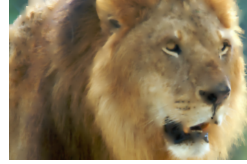
Minimizer of (1)