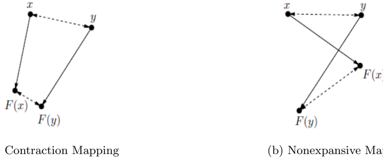
(a) Contraction Mapping